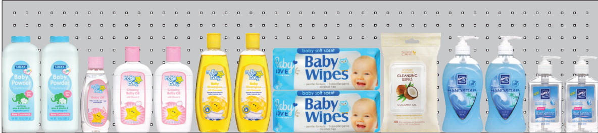
01 11 in