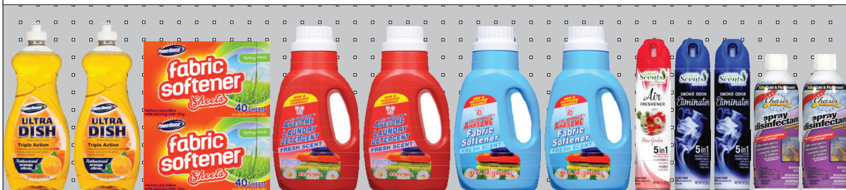
03 11 in