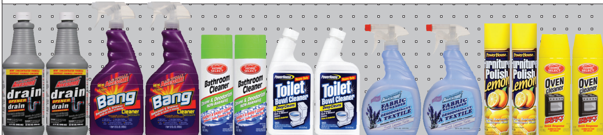
05 11 in