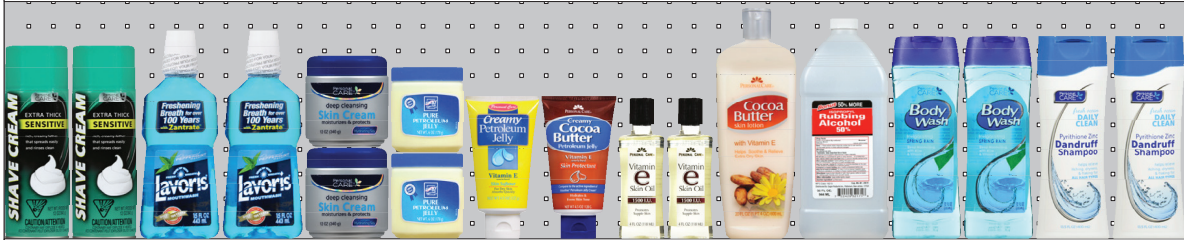
02 10 in