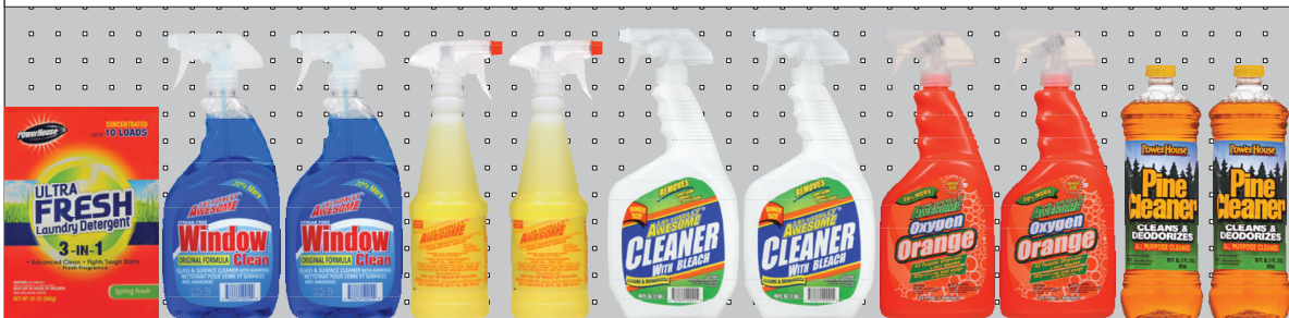
04 12 in