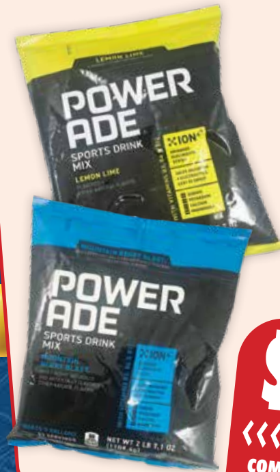
POWERADE SPORTS DRINK MIX Lemon Lime or Berry Blast Makes 5 Gallons (53 Servings)