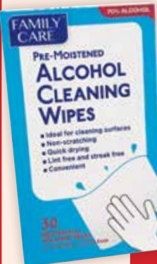
ALCOHOL CLEANING WIPES 30ct