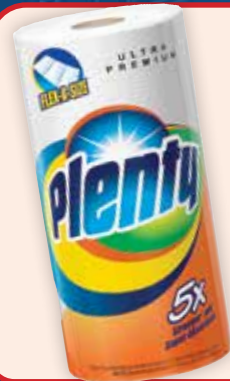
PLENTY PAPER TOWELS Ultra Premium, Flex-A-Size Single Roll