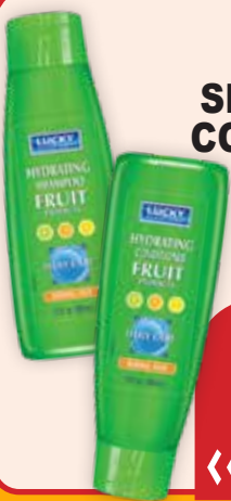
LUCKY HYDRATING SHAMPOO OR CONDITIONER 13oz

SEE OUR BACK PAGE TO GET READY FOR CLASSES!