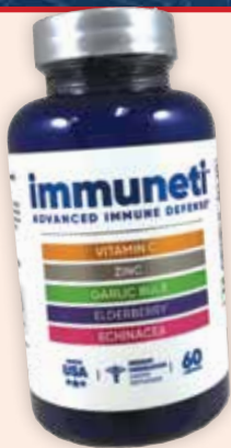
IMMUNETI IMMUNE DEFENSE