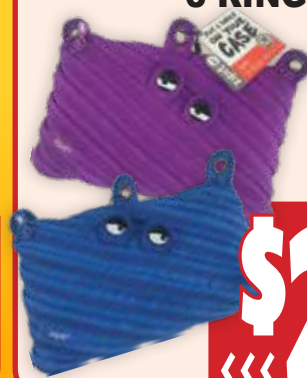
GRILLZ 3 RING BINDER POUCH