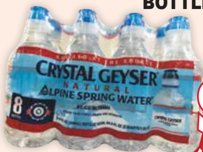
CRYSTAL GEYSER BOTTLED WATER 8oz Bottles 8pk