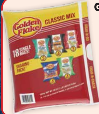
GOLDEN FLAKE MULTI-PACK 18ct