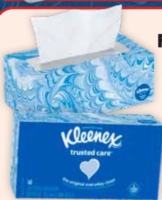
KLEENEX FACIAL TISSUE 160ct