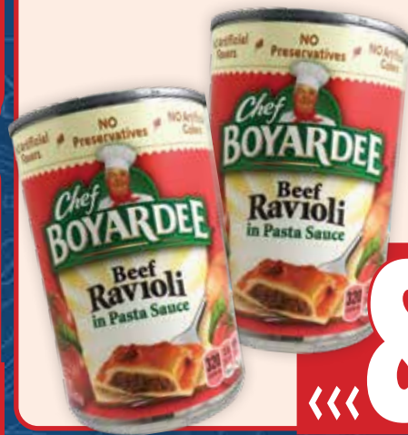
CHEF BOYARDEE BEEF RAVIOLI 15oz Can