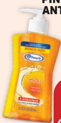
PINNACLE GOLD ANTIBACTERIAL HAND SOAP 11.25oz