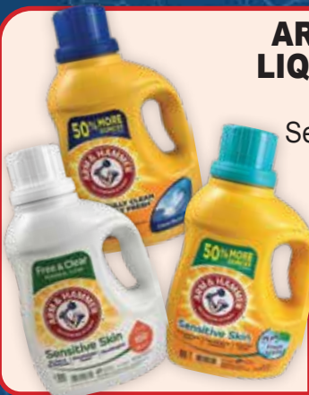
ARM & HAMMER LIQUID LAUNDRY DETERGENT Sensitive Skin, Clean Burst or Paradise 75oz