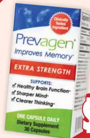
PREVAGEN Improves Memory Extra Strength (2x) 30ct Capsules